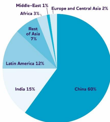
Fig. 1. Accumulated investment shares through the CDM Jan 2015

A typical example of “hardware financing” is the Clean Development Mechanism (CDM). Although supposedly neutral, the CDM greatly privileges countries such as China and India over those on the African continent (Fig. 1). Even accounting for the fact that China and India’s overall emissions are relatively high, the CDM still privileges them over African countries in investment per tonne of carbon emitted (Fig. 2).