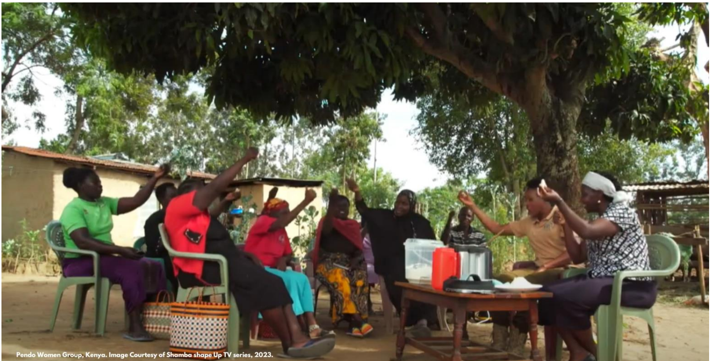
Pendo Women Group, Kenya.